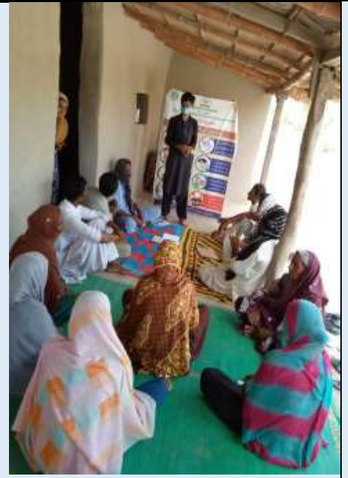
COVID-19 Session at Badin