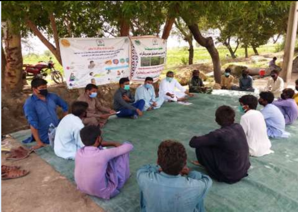
COVID-19 Session at Umerkot