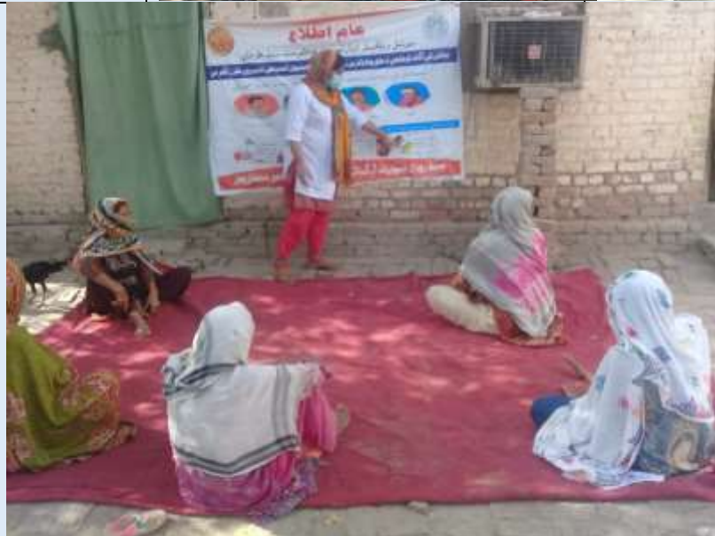
COVID-19 Awareness sessions, and training at District Shikarpur