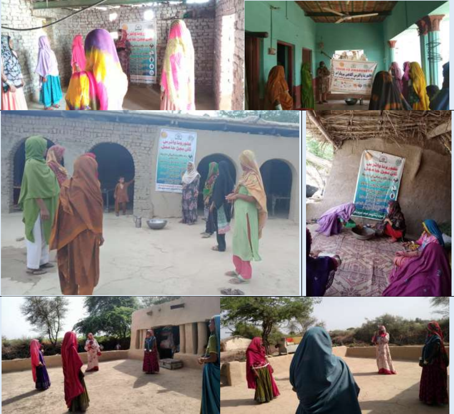
COVID-19 community based awareness sessions at Mirpurkhas District