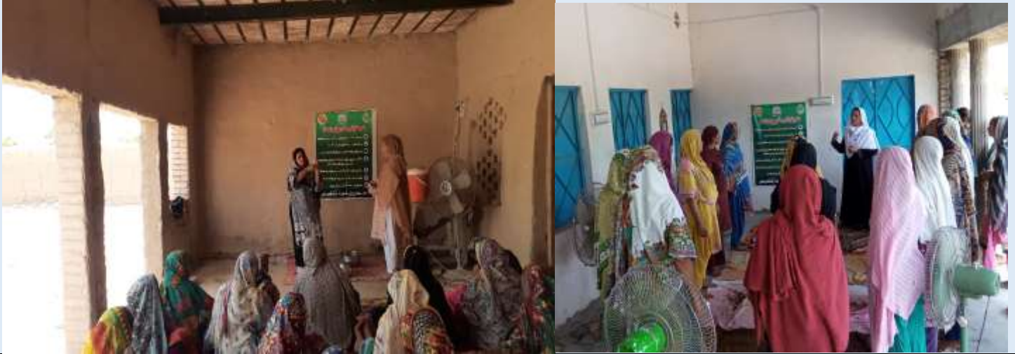
Covid-19 Community awareness campaigns at Khairpur District